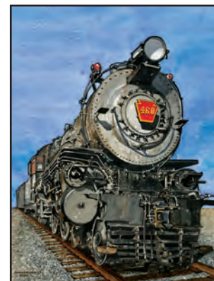
The Lindbergh Engine