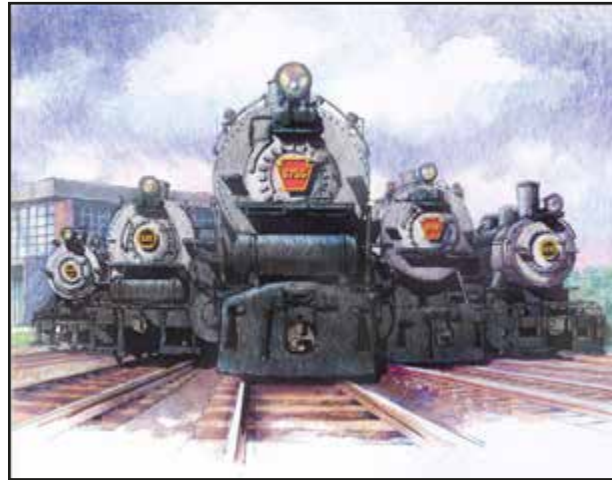
"Ready For The Roundhouse"